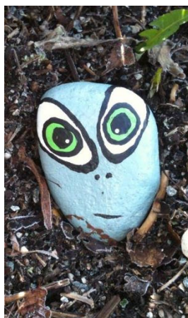
Aliens in the garden!