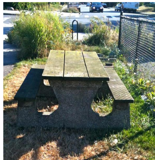
Newly acquired picnic table

We also had a fabulous windfall of daffodils donated by the City of North Vancouver that we sorted, dried, tied and then planted, so 400 or 500 sunny yellow heads should soon be waving in the spring breezes. GardenWorks donated a lovely cherry tree to us for Earth Day in April, and Maple Leaf Garden Centre cleared out their stock of spring bulbs in November and spread them out amongst the community gardens on the North Shore, so we have an amazing assortment of spring bloomers to add to the gardens for next year. One of our compost captains, Marge, visited her son in law for Thanksgiving with a large roll of wire in hand, and just happened to mention we needed a new compost screen – she came home with left-over turkey and two of the most beautifully crafted compost screens, with beveled edges and nary a stray metal prong in sight. Many thanks to her son-in-law, Andy Stokes who spent his holiday weekend crafting compost screens for people he’s never even met!