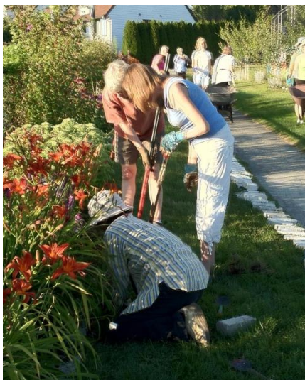
Brick brigade at work