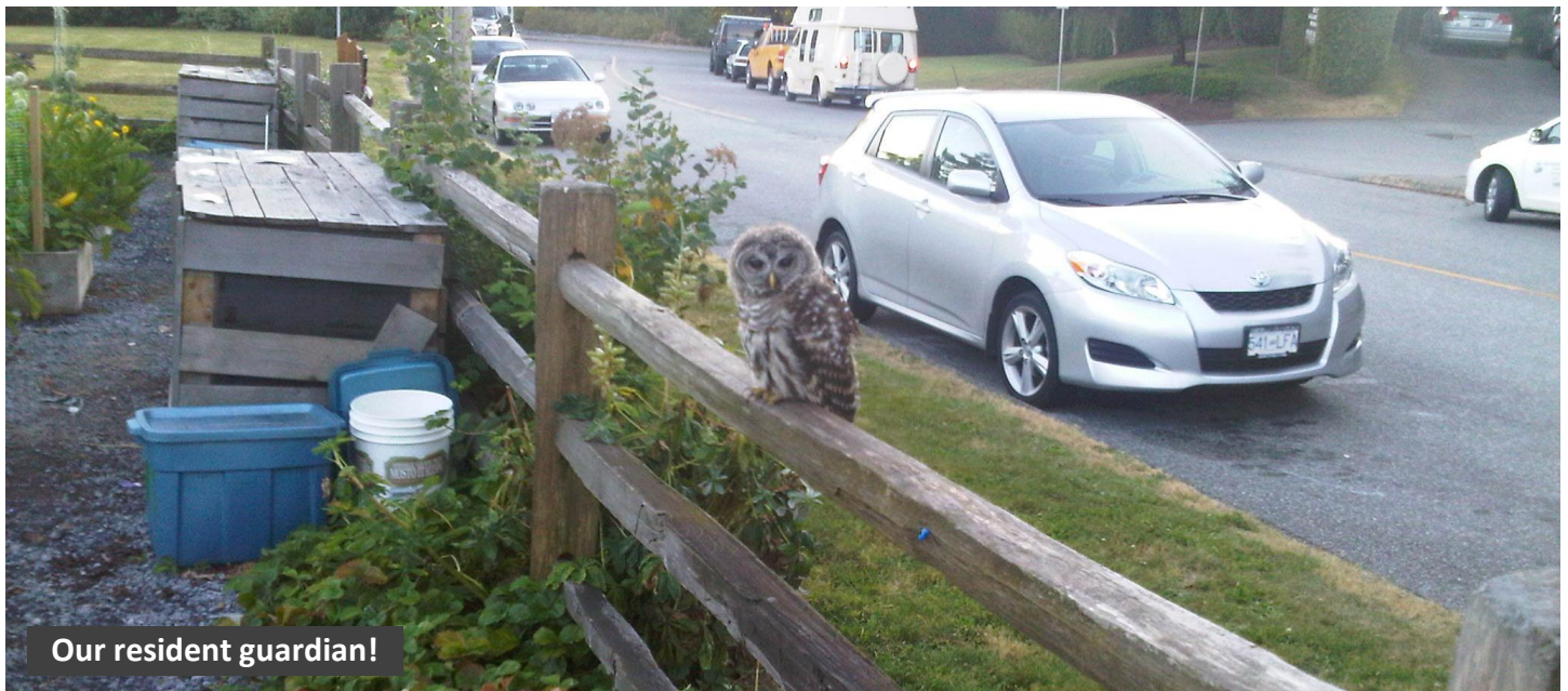
Our resident guardian!