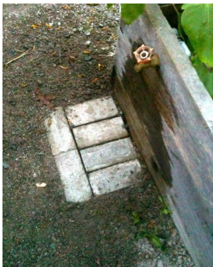
Water spout pads